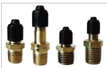
SN18NL, SN18LNL, SN25NL, SN25LNL