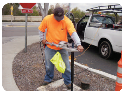
681150 in use