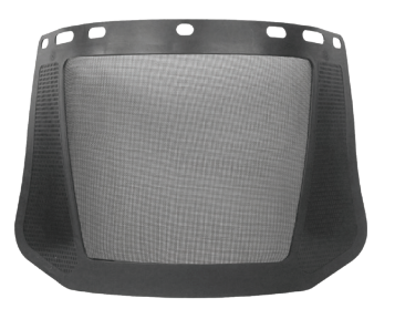
HDPE frame edge

Size: 6.75" x 16" x .0111' DESCRIPTION ITEM # 4000 - 1 per carton 15157