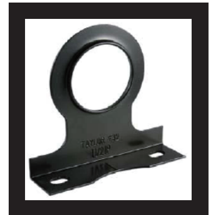
STANDARD PIPE STAY