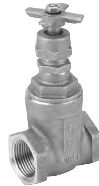
T-113-K Threaded With Cross Handle