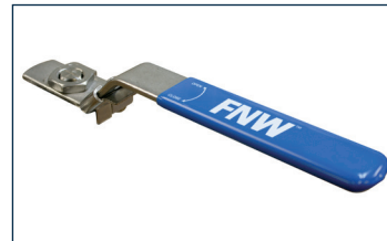
Replacement Locking Handle Kits (1/4"-3")