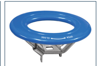
Oval Handle Kits (1/4"-1-1/4")