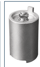
Stem Extension Kits (1/4"-2")