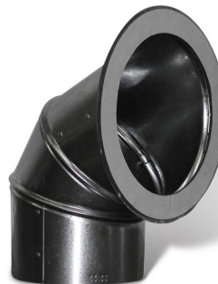
Adhesive ring with adjustable collar