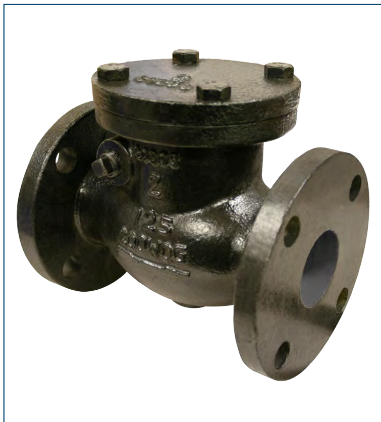
Figure Number Matrix