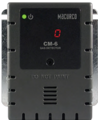
Grey Housing (Standard)