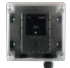
Weatherproof Housing Kit (Detector sold separately)