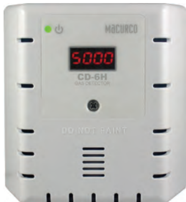
White Housing Option

The Macurco 6 & 12 Series fixed gas detectors provide life-saving solutions aimed to protect people and property. These fixed gas detectors are designed for low level detection, mitigation, and notification. Let these detectors do the work for you by shutting off valves, turning on fans, engaging horns and strobes, and provide notification to fire panels and building automation systems when gases reach key limits.