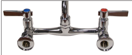
BACK VIEW 1/2" NPT(INSIDE THREAD)

FAUCET AERATOR CONFORM TO ASTM.A112.18.1M • 1.5 GPM/5.7 LP THREAD: 55/64 - 27 FEMALE