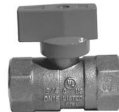
5200T Tee-Handle Version