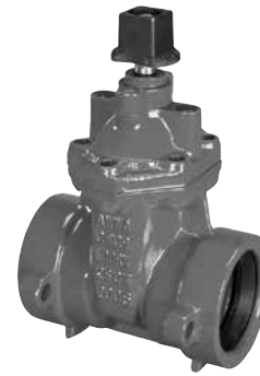
PCR-619-RW Ductile IPS Push-On