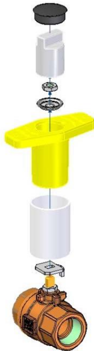
Figure 1: Exploded View

Step 7: Complete the assembly by pressing the plastic cap, Item 6, into the molded tee-handle.