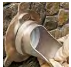
Solvent weld nozzle onto pipe and into escutcheon. Dura G-O-N requires the mounting notch in the escutcheon and the nozzle be aligned for proper contact.