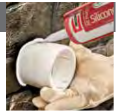
Caulk wall opening.