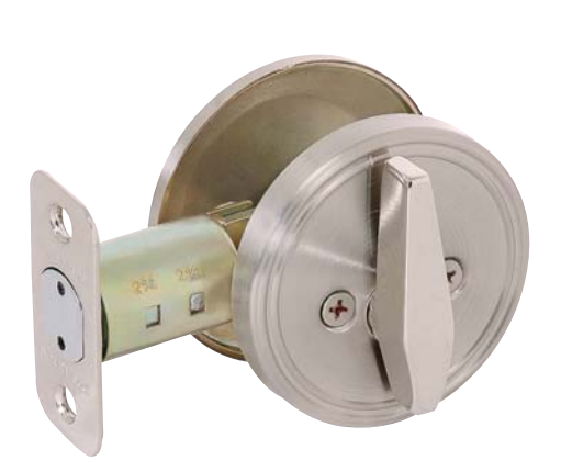
ONE SIDED BOLT WITH COVER