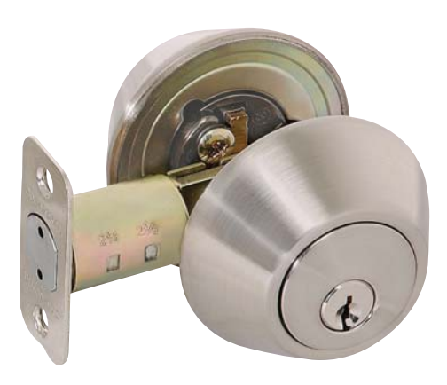
DOUBLE CYLINDER DEADBOLT