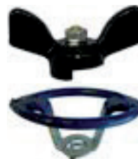
Tee or Oval Handle