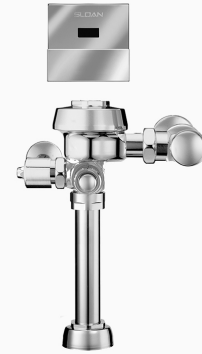
Variation Not Shown: Angle Stop Bumper