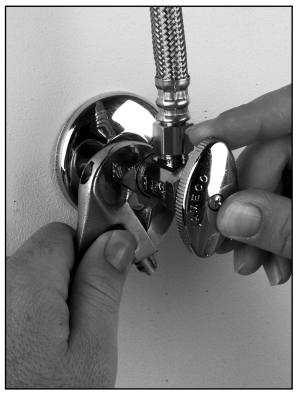
1. Turn off water supply and remove angle stops.