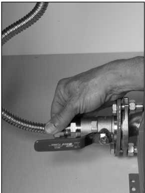
5. Connect flex lines to pump.