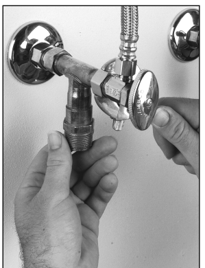
Install tees and attach angle stops.