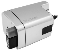
EBV-500/Battery Powered Single-flush Side Mount