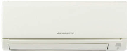
Indoor Unit: MSZ-GE06NA-9