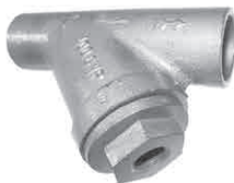
LF358 Solder ends