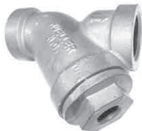
LF351 Screwed ends (shown) LF352 Screwed ends