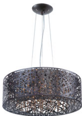
E21308-10BZ Inca 9-Light Pendant