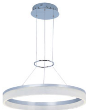
E22453-11MS Saturn 1-Tier LED Pendant