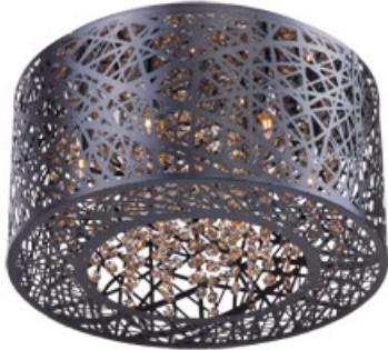
E21300-10BZ Inca 7-Light Flush Mount