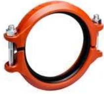
2 – 12"/DN50 – DN300