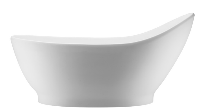
Features an integrated overflow.