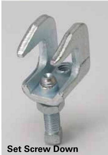
Set Screw Down