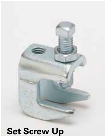
Set Screw Up