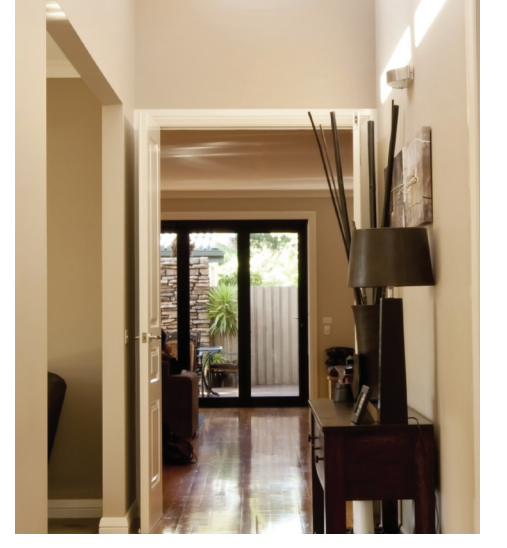
Able to mount to ceiling or wall