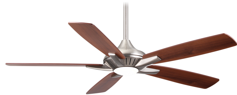
Reversible Blades - Dark Walnut