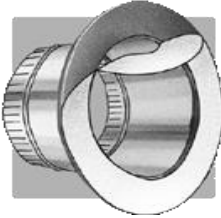
#535 (With Holes)