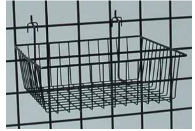
MERCH-6002 12" x 12" x 4" Wire basket black universal mount