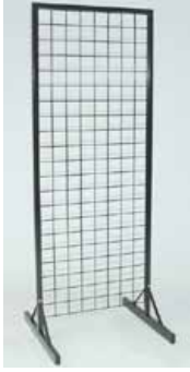
MERCH-6037 26" W x 69" H Mobile black grid floor unit