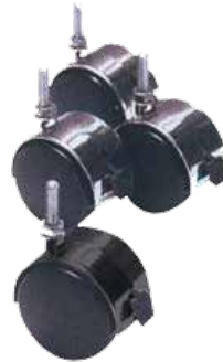
MERCH-6038 (4) Black hood caster set 3/8" for (Merch-6037) Mobile floor unit