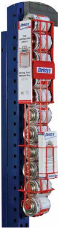
PRO-1033 Promotional Red Hot Blue Glue aisle merchandiser rack - 1/2 pints