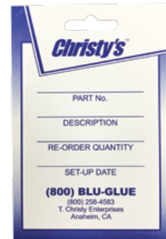
MERCH-6021 Merchandiser reorder hanging tags