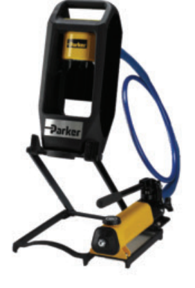
MiniKrimp with Handpump and Stand