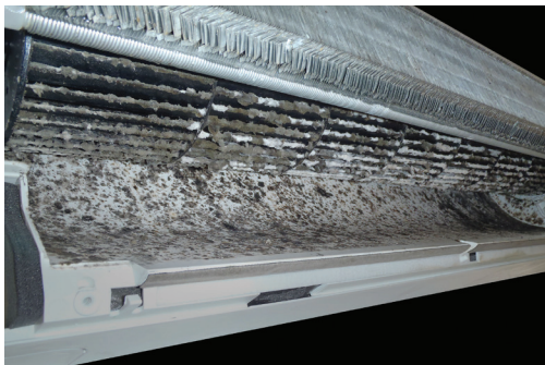
Mold thrives on mini-split blower wheels