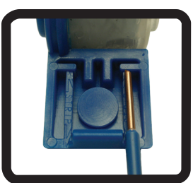
Strip wires to 5/8". Use the strip guide molded into the connector for reference.