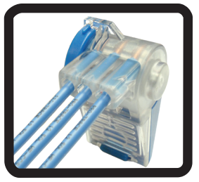
Hold wires in place while squeezing wings (handles) together until the latch snaps shut.

Spec Revision PRO-TRACE TW Connector, v5, updated 11.8.2019