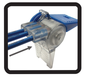
Insert striped wires into connector. The striped ends of the wires should be visible through the clear housing on the back.