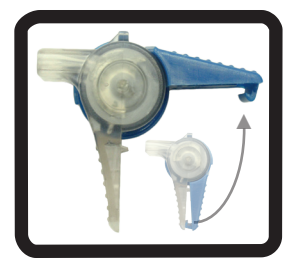
Open wings (handles) to 90 degrees position