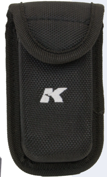
Carrying case included