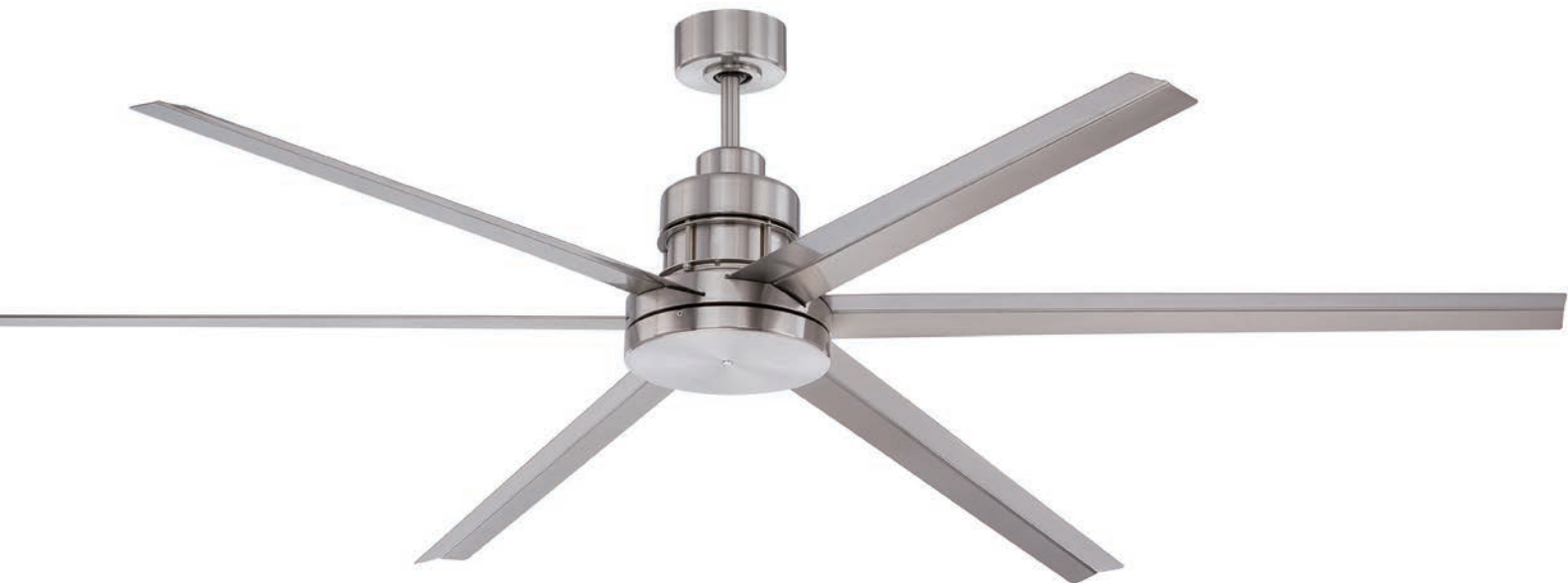
Brushed Polished Nickel Mondo 72" with 72" Silver Aluminum Blades Model . . . MND72BNK6 Blade . . . Included Light. . . . Not Available