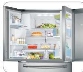
Food ShowCase Fridge Door