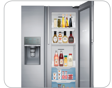
Food ShowCase Fridge Door