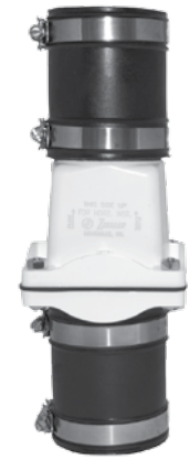
30-0021 Pvc Plastic

Consult Factory or local representative for state approvals