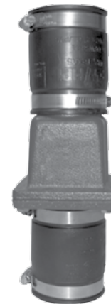
30-0151 Cast Iron