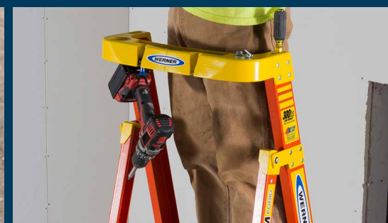
36 in. high extended guard rail