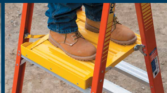
Extra-large platform for all-day comfort