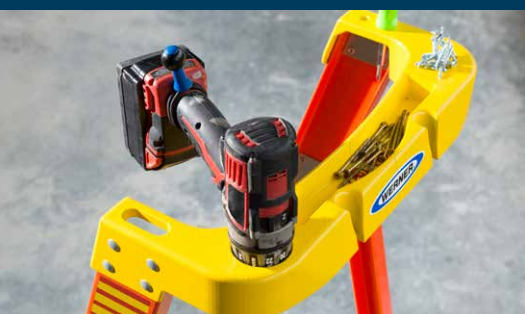
LOCKTOP™ secures tools and accessories