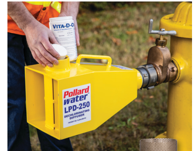
LPD-TABLETSCREEN (order separately)