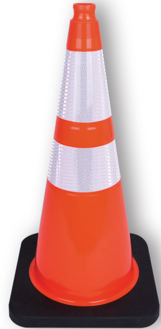
Standard 28" Cone with 6" & 4" Reflective Collars

Available plain or with reflective collars attached