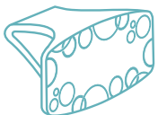
Eco Bowl Clip Toilet bowl air freshener

For best results, choose products with matching fragrances from Fresh