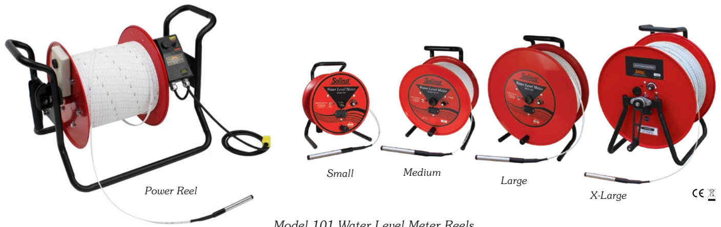
Model 101 Water Level Meter Reels