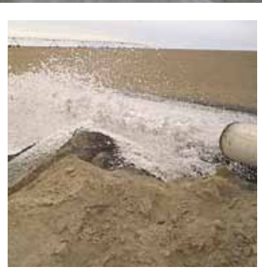
DRILLING FLUIDS GROUTS & SEALANTS POLYMERS & ADDITIVES WELL REHABILITATION SLURRY SOLIDIFICATION