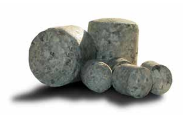
*Product images are not actual sizes.