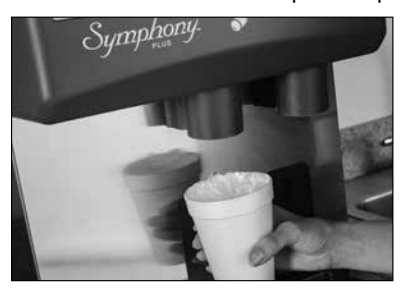
SensorSAFE not recommended for use with clear containers or for applications in direct sunlight