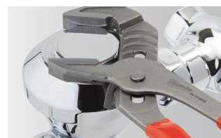
Non-Marring Smooth Jaw for Finish Applications