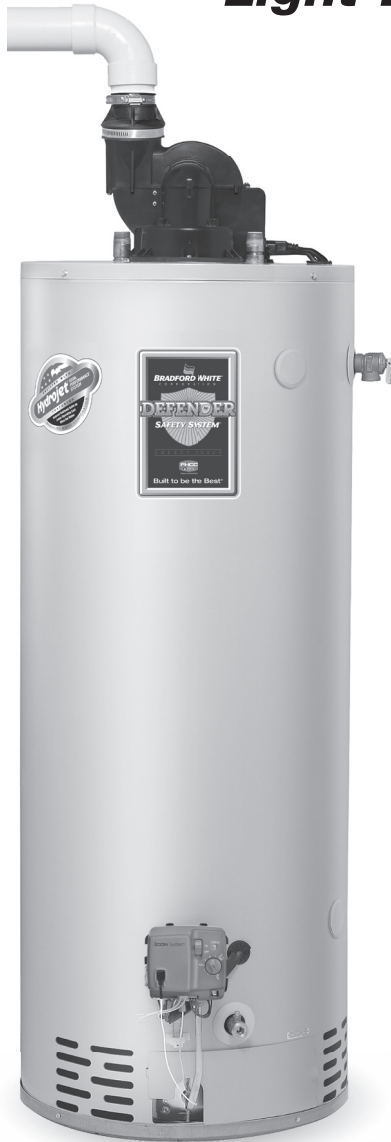
Photo is of LG2PV50H653N