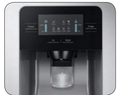
External Filtered Water and Ice Dispenser