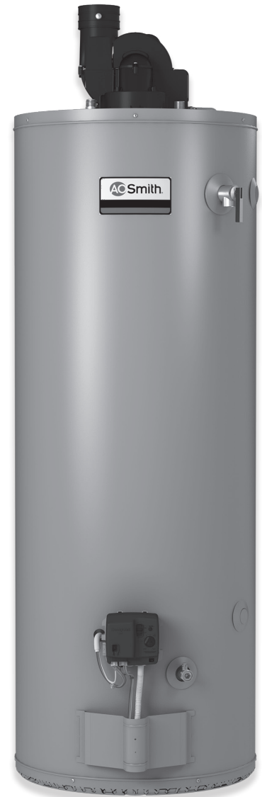
BPD-80 SERIES 210/211